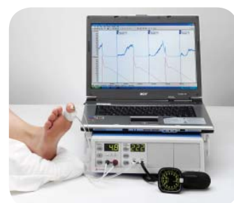
1-channel PeriFlux System 5000, measuring at one site.