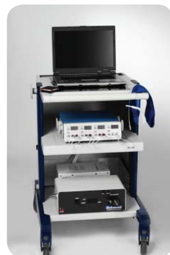
3-channel PeriFlux System 5000 including automatic cuffinflator for measurement at three sites simultaneously.