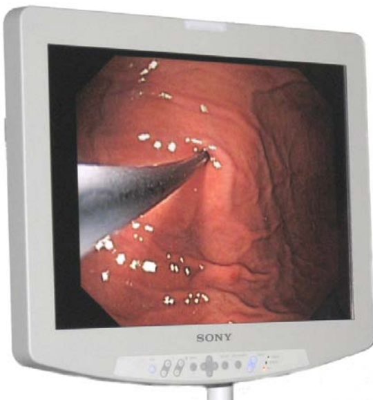
Figure 1: PROBE 409 resting against the intestinal mucosa.

The inherent movements of the gastrointestinal tract can make laser Doppler measurements difficult to carry out. During measurements, consider the following: